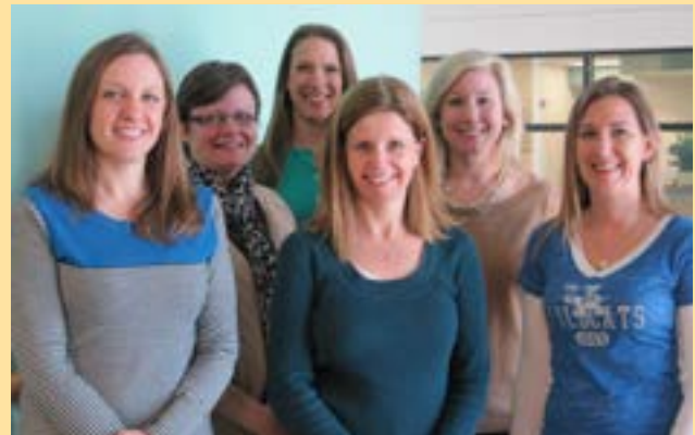
The Psych-Once Team held an Open House on March 20.

Collectively, the team makes an estimated 35-40 contacts per week – they regularly check in through in-person visits, texts, and phone calls to make sure the patients continue to get what they need throughout the treatment and beyond.